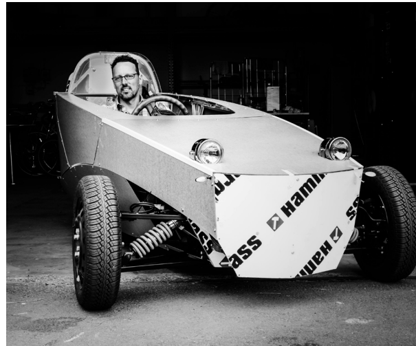
The founder in our functional demonstrator

Ecoist develops the Tian, that will be 15 times more energy efficient than cars on the road today. A two-seater tandem, three wheeler that can reach 110km/h and has 100km range to start with. The body, made in natural fiber composite is optimized to have very low air resistance and the rigid steel chassis handles the forces from driving.